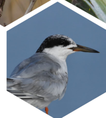
Clockwise from top: Purple Gallinule ; Barred Owl ; Painted Bunting ; Common Tern ; Bald Eagle ; Sedge Wren